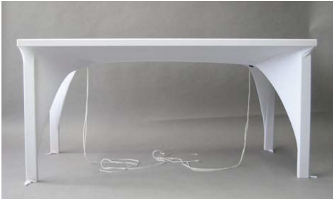
'Skin' tablecloth by Teija Losoi